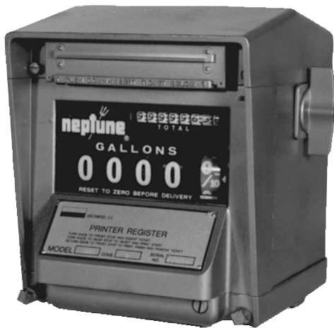
Model 833 Register

Models 834 and 844 are printer-preset registers that combine the features of the other registers. They contain the preset quantity control plus the printed ticket features.