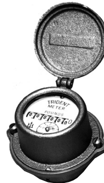
Model 157 Register