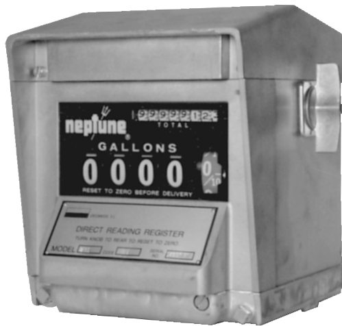
Model 831 Register

Models 833 and 843 are the basic 830 and 840 features plus a printer register that prints a receipt or ticket