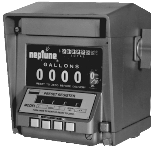
Model 832 Register