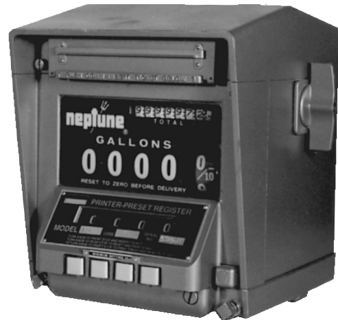
Model 834 Register