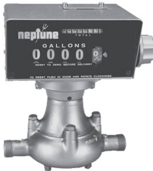
Type S Flowmeter with 600 Series Register